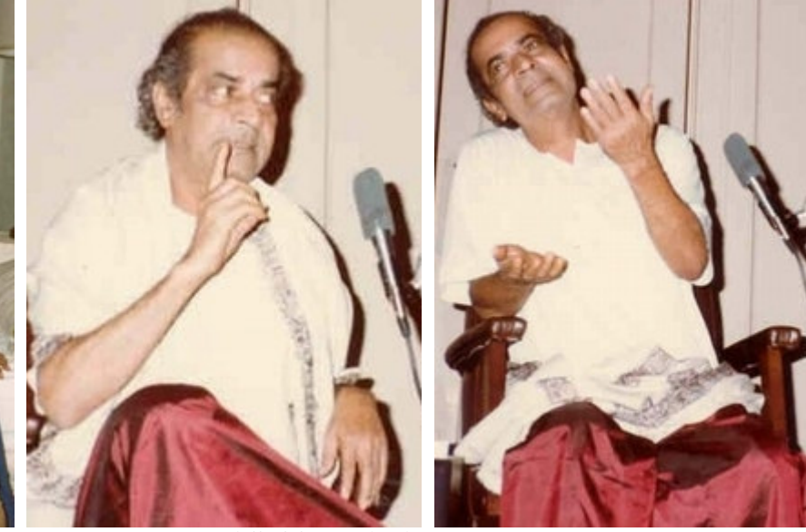
Dadaji visits Portland Oregon USA 1983