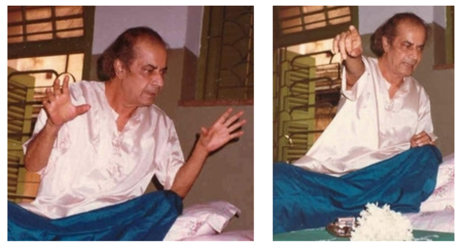
Dadaji talking at Utsav in Somnath Hall, Calcutta 1983

If the mind is not, even for a short time, the Almighty is.