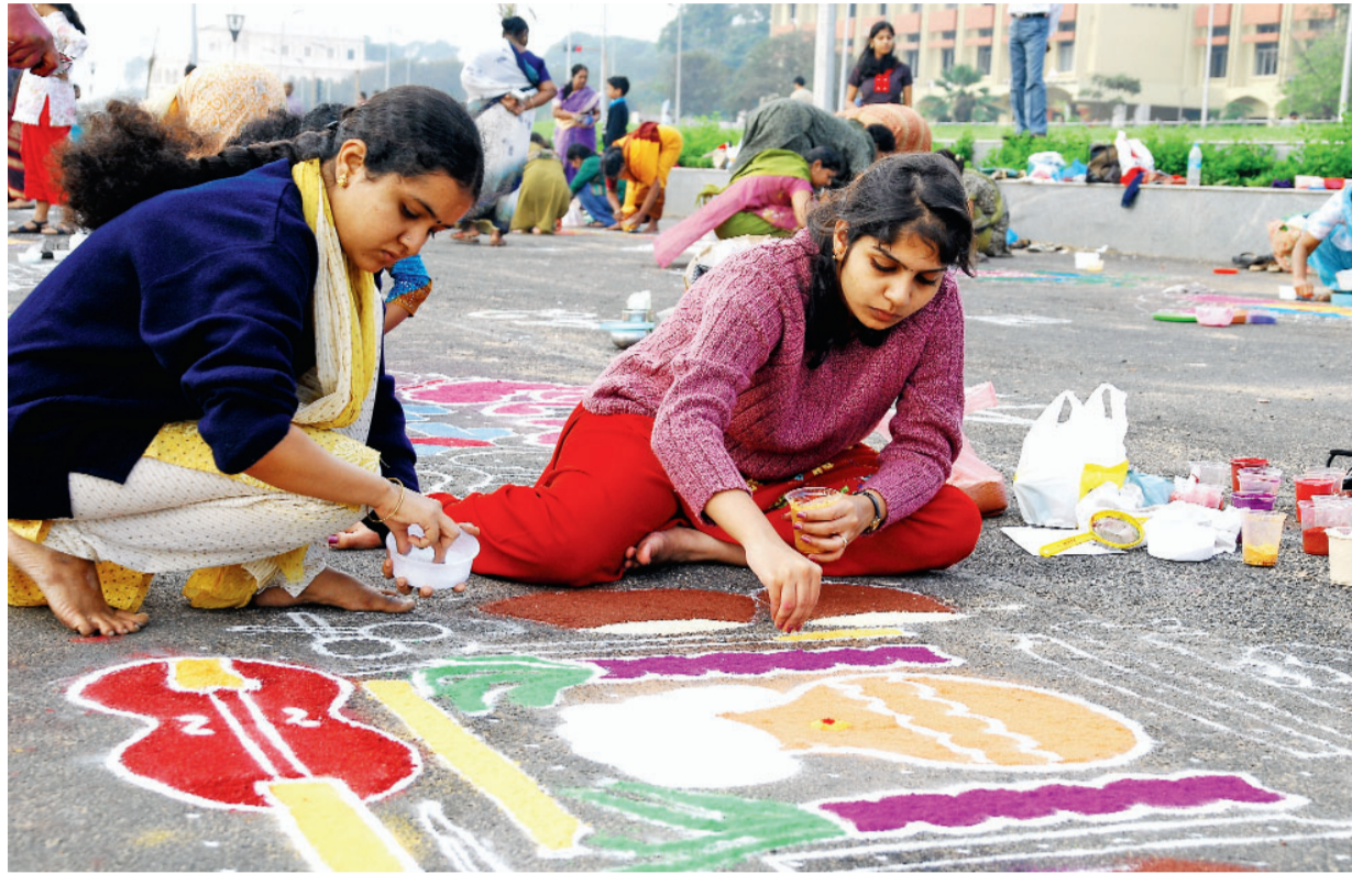
A KOLAM COMPETITION IN PROGRESS ON THE STREETS OF CHENNAI (FILE PHOTO)

Today, kolams have cut across social milieus, becoming an occasion for private and public participation. There are kolam competitions in almost every